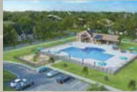
Pool, Cabana & Grilling Stations